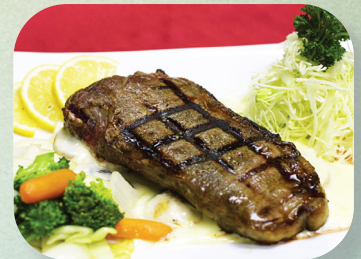
New York Strip Steak