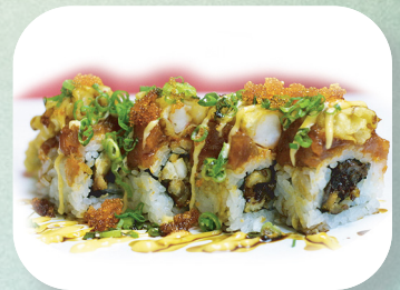
Open your mouth