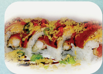
Rolling Stone Roll

Ask chef's special roll any time!! Our chef makes special roll for you. Just let us know what you like or what you do not like